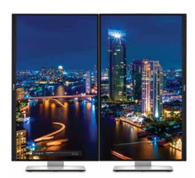
For more information visit www.dell.com/monitors