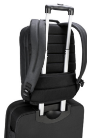
Dell Premier Slim Backpack 14