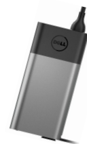
Dell Hybrid Adapter + Power Bank - PH45W17-CA