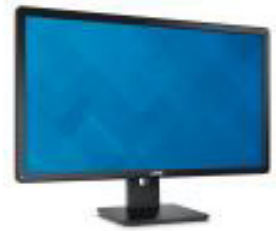
Dell 24 Monitor | E2417H