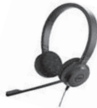
Dell Pro Stereo Headset – UC350