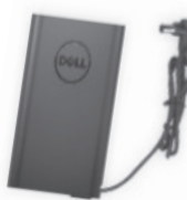
Dell Portable Power Companion (18000 mAh) - PW7015L