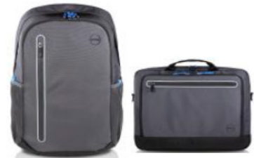
Easy to carry Dell Urban backpack or briefcase.