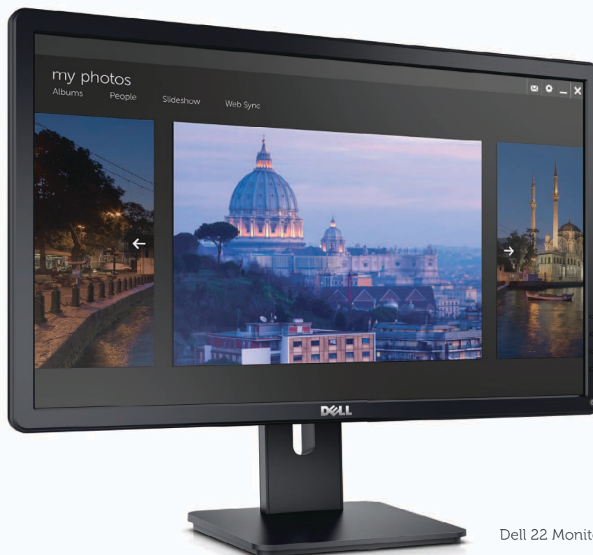
Dell 22 Monitor | E2214H (54.60 cm, 21.5")