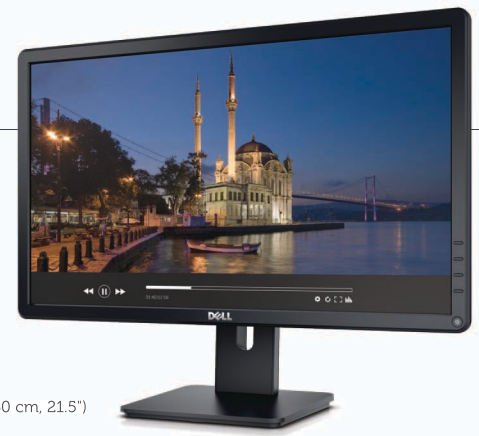
Dell 22 Monitor | E2214H (54.60 cm, 21.5")