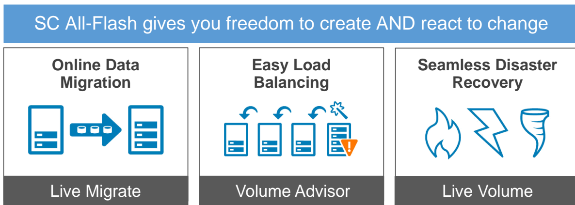
Fig. 1 – Change storage configurations quickly without impacting your workloads. Federated architecture with built-in auto-failover makes SC All-Flash the smart choice to deliver consistent value in volatile business environments.

Included Live Volume also keeps workloads running during unexpected outages and disasters. Non-disruptive auto-failover between fully-synchronized volumes on local and remote arrays protects your vital business operations with no need for extra hardware or software purchases. Live Volume helps you achieve ZERO RTO/RPO, and even auto-repairs your high-availability environment when a downed array comes back online.