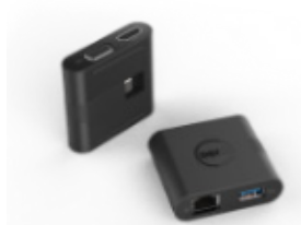
Dell Adapter DA200 – USB-C to HDMI/VGA/Ethernet/USB 3.1 Gen 1