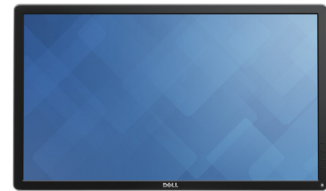
Dell UltraSharp 24 InfinityEdge Monitor – U2417H WOST