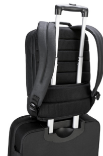
Dell Premier Slim Backpack 14