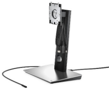
Dell Dock with Monitor Stand - DS1000