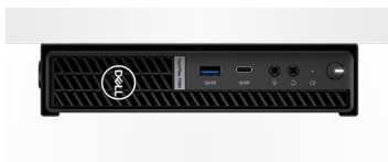
OPTIPLEX MICRO VESA MOUNT WITH ADAPTER BRACKET

Mount your system on a wall or under a surface with a VESA-compatible DVD+/-RW enclosure with full optical drive access. Includes an adapter box to securely house the system's power adapter.