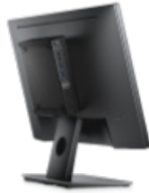
OPTIPLEX MICRO ALL-IN-ONE MOUNT FOR DELL E SERIES MONITORS

Small footprint mounting solution adapts to your environment, with cable management and monitor height adjustability, tilt, swivel and pivot functions.