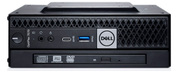
OPTIPLEX MICRO DVD+/-RW ENCLOSURE

Mount your system between two VESA compatible devices. Includes an adapter box to securely house the system's power adapter.