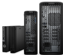
OPTIPLEX CABLE COVERS

Wired mouse with fingerprint reader offers convenient and secure login and online access without passwords.