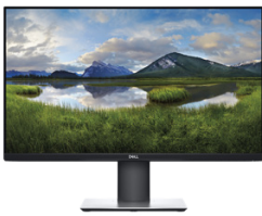
DELL 24 MONITOR - P2419H

23.8" ultrathin bezel optimized for dual display productivity. Easy Arrange feature enables multitasking efficiency and its small base frees valuable workspace.