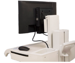
OPTIPLEX MICRO DUAL VESA MOUNT WITH ADAPTER BRACKET

This mount allows the Micro to be VESA mounted to select Dell E Series displays.