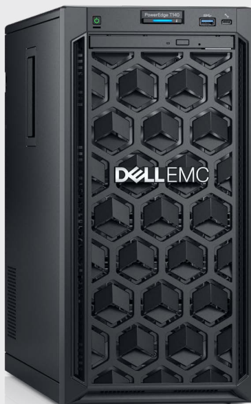
PowerEdge T140 Tower Server†

For many tasks, especially predictable ones, running them on a server can cost less than public cloud. Public clouds add flexibility and may work well for unpredictable workloads. A Small Business Technology Advisor can help you determine the right solution for your business - server, cloud or a hybrid approach.