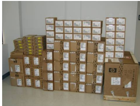
Figure 3B: The HP boxes after we brought them up to our lab.