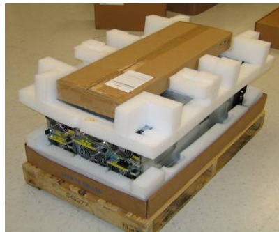
Figure 5B: The HP server with outer cardboard covering removed.