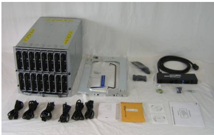
Figure 1A: The Dell equipment immediately after we unpacked it.