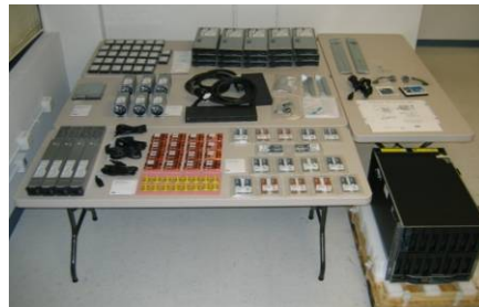
Figure 1B: The HP equipment immediately after we unpacked it.