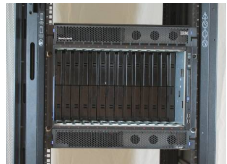
Figure 7C: The IBM chassis installed on the rails.