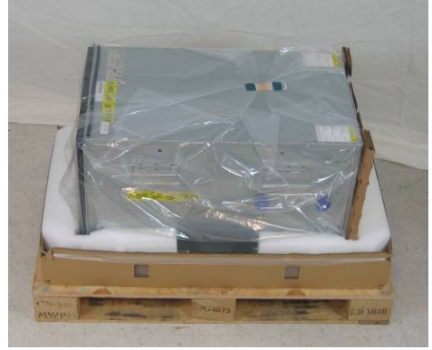
Figure 6C: The IBM server with foam pieces removed.