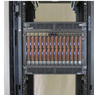
Figure 8C: The IBM blades and power supplies installed in the chassis. (Power supplies in back are not visible.)