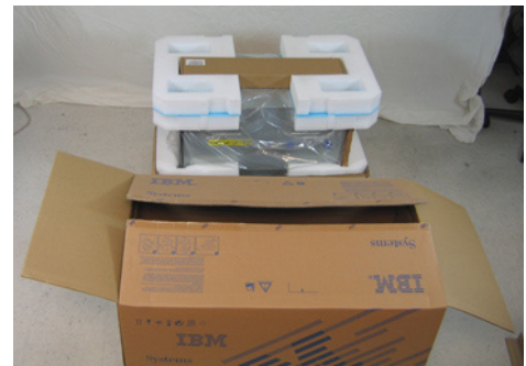
Figure 5C: The IBM server with outer cardboard covering removed.