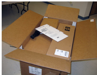
Figure 4B: Opening the HP server box.