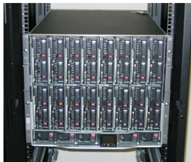
Figure 7B: The HP chassis installed on the rails.