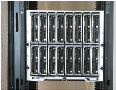
Figure 8A: The Dell blades and power supplies installed in the chassis. (Power supplies in back are not visible.)