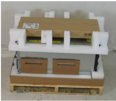
Figure 5A: The Dell server with outer cardboard covering removed.