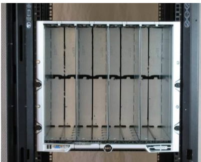
Figure 7A: The Dell chassis installed on the rails.