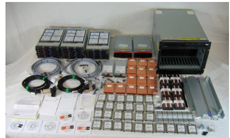
Figure 1C: The IBM equipment immediately after we unpacked it.

Figure 2 summarizes the amount of time we spent unpacking each system and installing it in the server rack. Compared to the process for the Dell system, the process for the HP system took more than 12 times as long and the process for the IBM system took more than seven times as long.