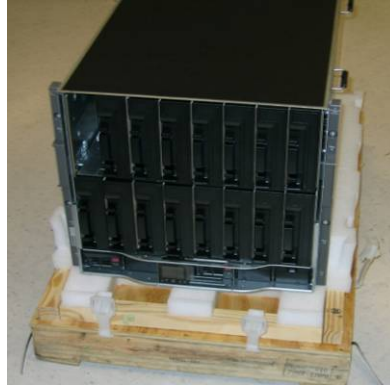
Figure 6B: The HP server with plastic wrap removed.