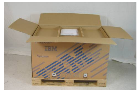
Figure 4C: Opening the IBM server box.