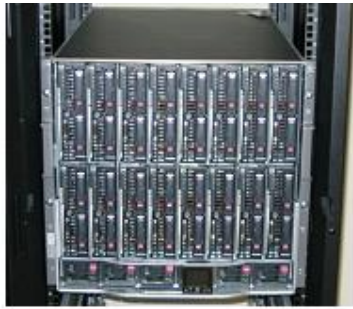
Figure 8B: The HP blades and power supplies installed in the chassis.