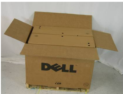
Figure 4A: Opening the Dell server box.