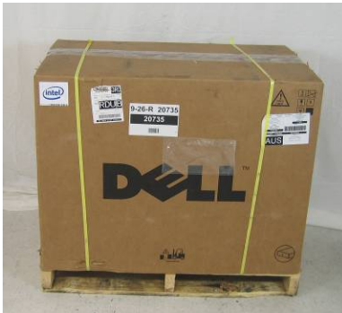
Figure 3A: The Dell box upon delivery in our lab.

The smaller boxes contained additional boxes inside. After unpacking these boxes, we had counted 62 total boxes for the IBM installation. Figure 3C shows these 62 boxes.