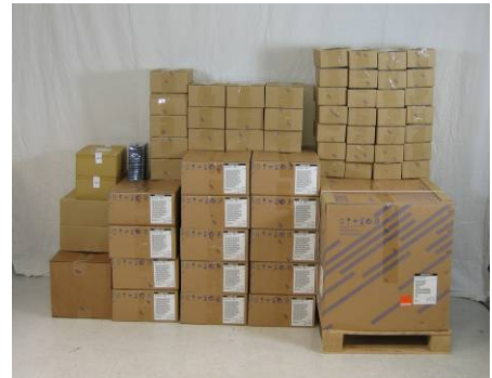
Figure 3B: The IBM boxes after we unpacked them from the shipping boxes.