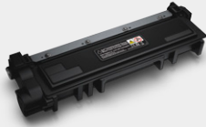
Dell E310/514/515 series Black Toner Cartridge, 1,200 page yield 4