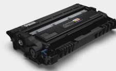
Imaging drum, up to 12,000 pages