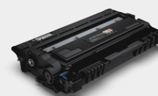
Imaging drum, up to 12,000 pages

Effortless efficiency. 3-in-1 versatility.