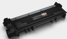
Dell E310/514/515 series Black Toner Cartridge, 1,200 page yield 4