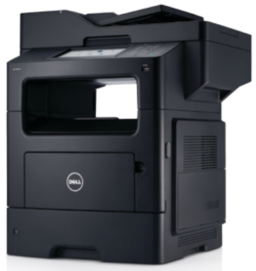
Dell™ B3465dnf Mono Laser Multifunction Printer

Match your growing business needs with this multifunction workgroup printer and gain efficiency for your business.