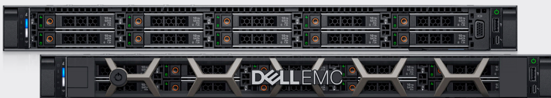
PowerEdge R640 Rack Server with Intel® Xeon® processors