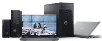
Sustainability on Precision Workstations