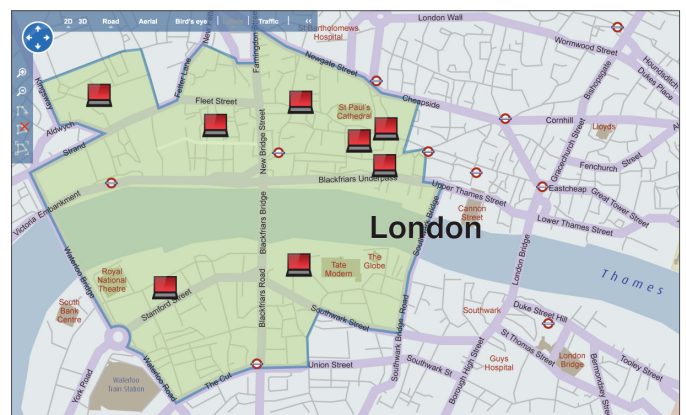
Customer view of IT assets within Absolute Customer Centre, with geofencing enabled.

If a system is stolen, file a theft report. The next time the system connects to the internet, the Absolute Theft Recovery Team will forensically mine it using a variety of procedures including key captures, registry and file scanning, geolocation, and other investigative techniques to determine who the system and what they're doing with it. Then they will work with local law enforcement to recover the device.