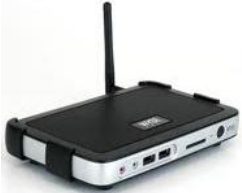
Terminal Services T Class