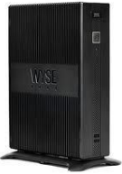
Windows Embedded R & Z Class