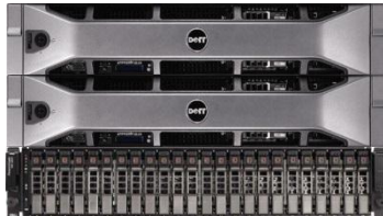
Metadata Server (MDS) Pair

The Metadata Server (MDS) stores the file system metadata. The Metadata Server Pair consists of two highly available active/passive PowerEdge R710 metadata servers connected to a PowerVault MD3220 with 12TB of raw shared storage. To provide high bandwidth and low latency link for clients to reach user data, each Metadata server provides QDR InfiniBand connectivity for clients. The MDS pair provides a single name space for the user data stored in one or more Object Storage Servers.