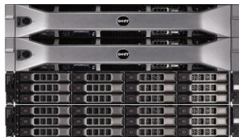
Object Storage Server (OSS) Pair

The Object Storage Server (OSS) stores the user data. The OSS pair consists of two highly available active/active PowerEdge R710 object storage servers connected to two PowerVault MD3200 storage enclosures. Each OSS pair provides up to 6.2 GB/s i of read throughput and up to 4.2 GB/s i of write throughput. From a minimum of 48TB of raw capacity, each OSS pair can scale up to a maximum of 384TB by adding PowerVault MD1200 disk enclosures to an OSS pair.