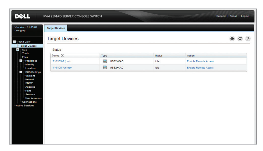
Figure 1. On-board Web interface (OBWI) for the Dell KVM server console switch

Dell KVM switches support Virtual Media, a technology that allows a server to access storage media such as CDs, DVDs, ISO images, flash drives, and external hard drives attached to the switch or anywhere on the network. To enable local Virtual Media, the storage device is simply attached to a USB port on the switch, which allows any server connected to that switch through a Virtual Media SIP to access the