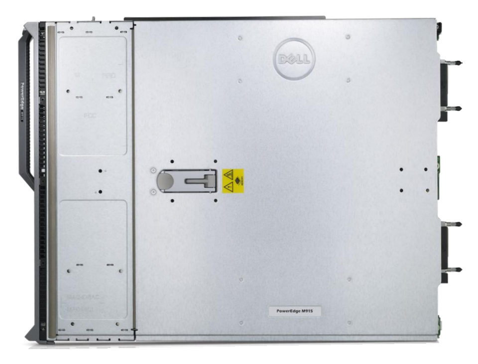
Figure 3. Side view

Figure 3 shows the side view of the M915.