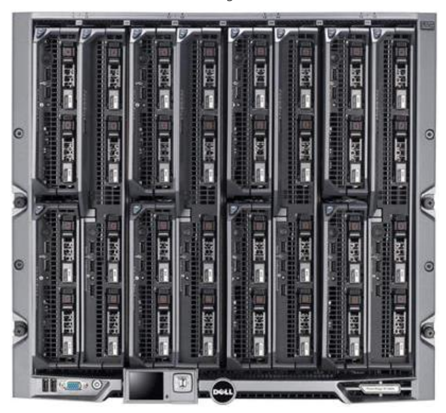
Figure 5. M1000e chassis

Figure 5 shows the M915 mounted in the PowerEdge M1000e chassis.