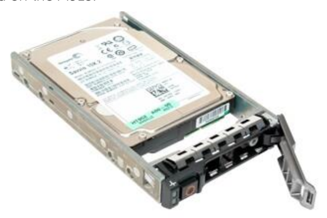
Figure 6. 2.5" Hard drive carrier

The M915 supports the Dell eleventh-generation 2.5" hard drive carrier (see Figure 6). Legacy carriers are not supported on the M915.