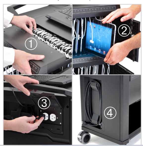
Easy one-time setup