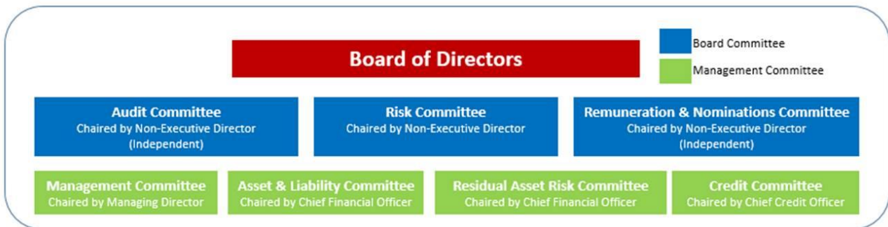
Diagram: Oversight and Information flow – Management Committees

The chart below displays the Bank's three lines of defence model.