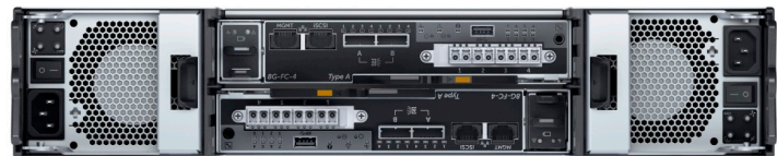
Figure 1: Back panel of a Dell Storage SC4020 controller and drive shelf, showing both controller modules and the assortment of connectivity/ports.

At the heart of the SC4020 is a new controller that unlocks a smaller, highly efficient footprint and opens up new price points and an entirely new market. While maintaining a software architecture the same as Dell’s enterprise SC8000’s traditional dual