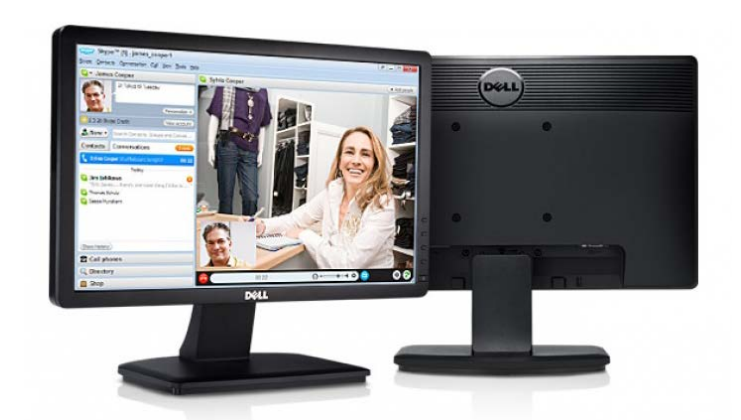
Figure 1: Dell E1912H 19" monitor.

In research conducted in 2012, Dell determined the carbon footprint of the E Series E1912H 19" monitor, a typical high-volume, mainstream business monitor that is representative of a range of similar monitor products. It is Energy Star® compliant and EPEAT Silver registered.