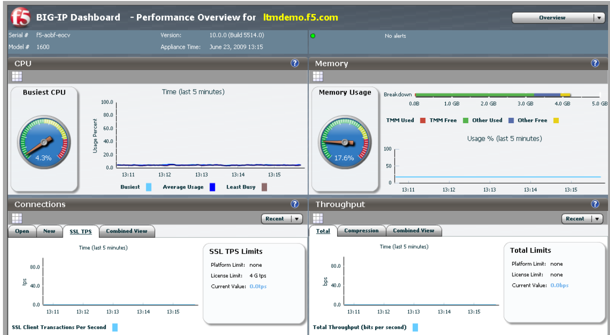
Figure 2: LTM V10 Dashboard