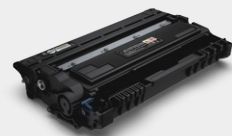
Imaging drum, up to 12,000 pages