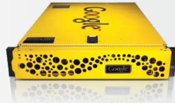
OEM ready customized Dell™ PowerEdge™ R710 server

When you need fully customized systems with your own brand, OEM-custom products allow you to modify the look and feel of select Dell hardware the way you want. For instance, you can add your own color and logo to a Dell server bezel or even integrate your own bezel design. You can also access custom-consulting services to help with mechanical, engineering and regulatory requirements.