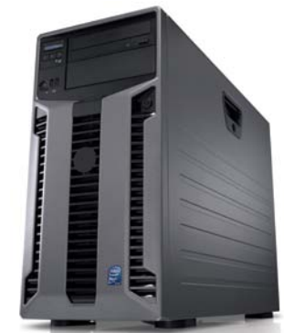
Dell PowerEdge T710 server

For faster time to market, OEM-ready products provide generic packaging and documentation and do not require additional setup fees. Simply add your own labeling and logos to blank Dell™ PowerEdge™ server bezels or select Dell OptiPlex™ desktops.