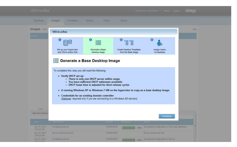
Figure 3: Intuitive, wizard-supported, four-step configuration

2. Grid configuration—If the organization has multiple DVS Simplified appliances, the servers must communicate to share images and balance the load. With just a few clicks, the administrator can link them together by placing them on the same DVS Simplified grid.