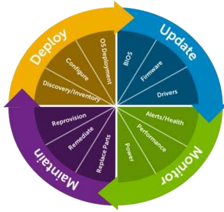
Figure 12. Systems management server lifecycle

Table 28 lists the products that are available for one-to-one and one-to-many operations, and when they are used in the server's lifecycle.