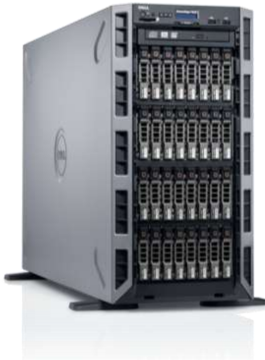
Figure 1. Front view without bezel

Figure 1 shows the front view of the 32-drive bay tower chassis without a bezel. Features on the front panel include an interactive LCD control panel, USB connectors, a video connector, and a vFlash media card slot.