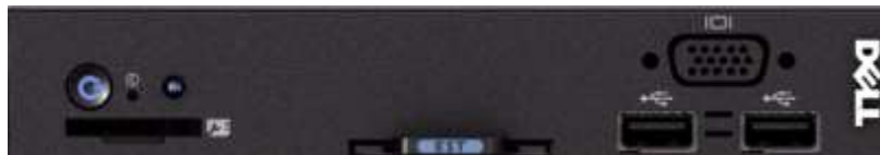
Figure 7. Rack system with VGA port

The front control panel for a rack server has a VGA port to support a monitor.