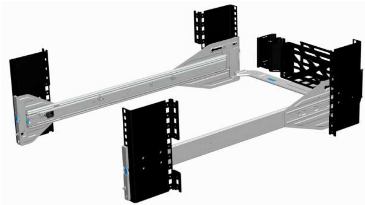
Figure 10. Sliding rails with optional CMA

The sliding rails are available with or without the optional CMA. Figure 10 shows the sliding rails with the optional CMA.