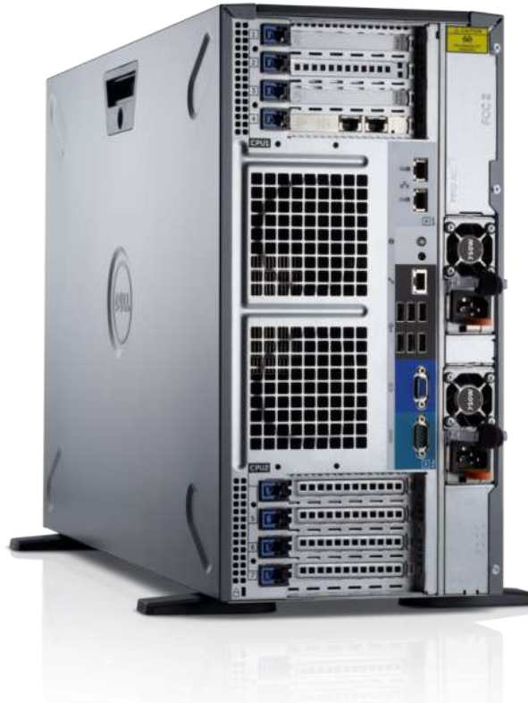
Figure 4. Back view

Figure 5 is an internal view of the T620 showing processor heat sinks and associated DIMM slots.