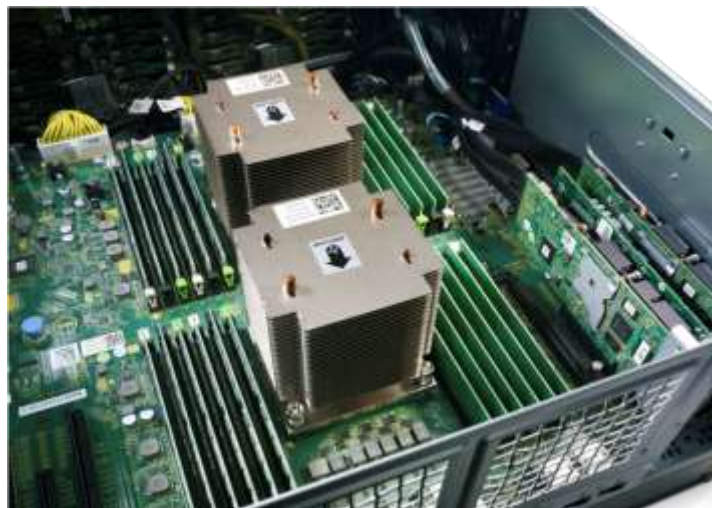
Figure 5. Internal view

For additional system views, see the Dell PowerEdge T620 Owner's Manual on Dell.com/Support/Manuals .