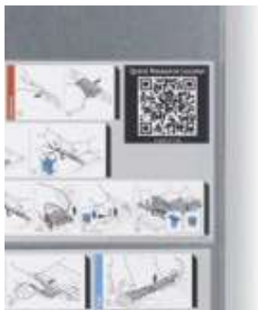
Figure 8. QRL code inside chassis cover

Dell PowerEdge 12 th -generation servers include a Quick Resource Locator (QRL) — a model-specific Quick Response (QR) code located inside the T620 chassis cover (see Figure 8). Use your smartphone to access the Dell QRL app to learn more about the server.