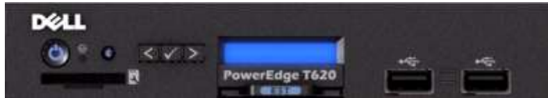
Figure 6. Tower system with LCD panel

The front control panel for a rack server has a VGA port to support a monitor.