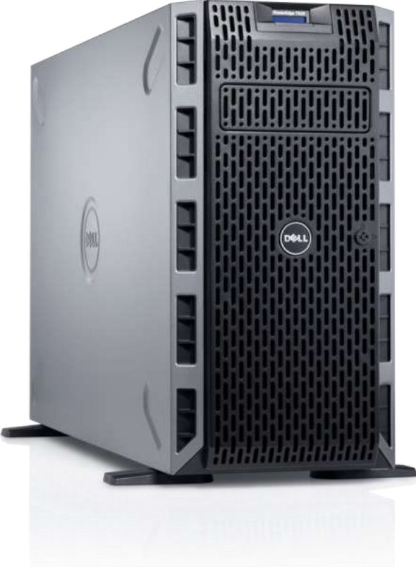
Figure 2. Front view with bezel

Figure 3 shows the front view of the rackable T620 chassis without a bezel.