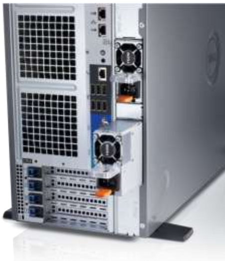
Figure 9. 750W power supply unit

The PowerEdge T620 supports up to two AC or DC power supplies with 1 + 1 redundancy, auto-sensing and auto-switching capability.