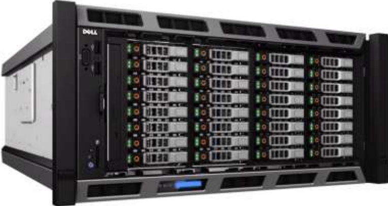
Figure 3. Rackable front view without bezel

Figure 3 shows the front view of the rackable T620 chassis without a bezel.