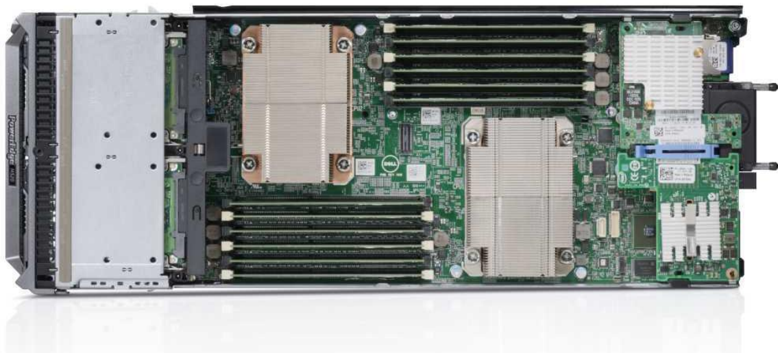
Figure 3. M520 internal module view

For additional system views, see the Dell PowerEdge M520 Systems Owner's Manual on Dell.com/Support/Manuals .