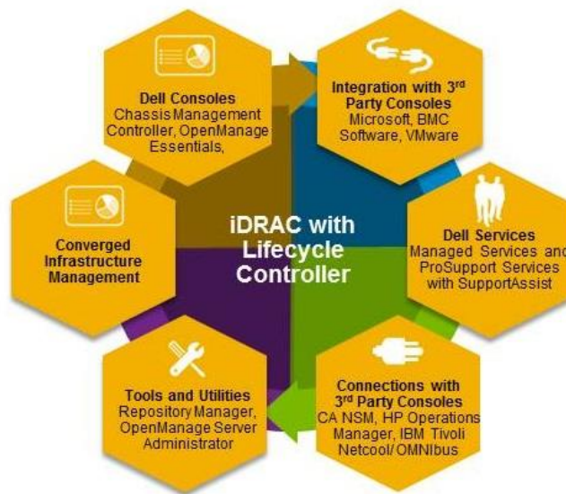
Figure 5. Dell systems management solutions

Dell systems management solutions include a wide variety of tools, products and services that enable you to leverage an existing systems management framework. As shown in Figure 5, Dell systems management solutions are centered on OpenManage server management, featuring iDRAC with Lifecycle Controller.