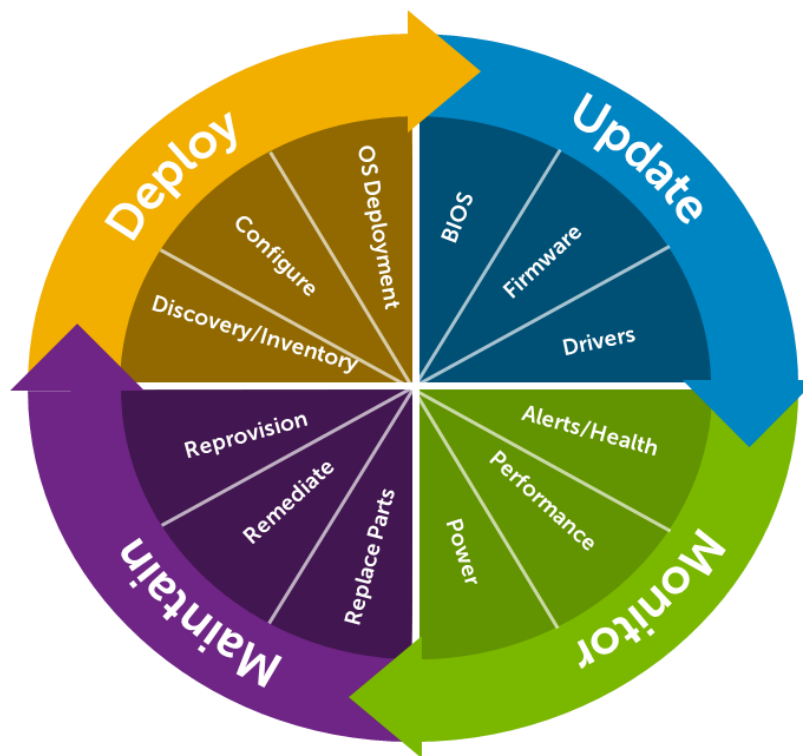
Figure 6. Systems management server lifecycle

Dell OpenManage systems management is centered on automating the server management lifecycle — deploy, update, monitor and maintain. To manage an infrastructure properly and efficiently, you must perform all of these functions easily and quickly. iDRAC7 with Lifecycle Controller technology provides you with these intelligent capabilities embedded within the server infrastructure. This allows you to invest more time and energy on business improvements and less on maintenance. Figure 6 illustrates the various operations that can be performed during the server's lifecycle.