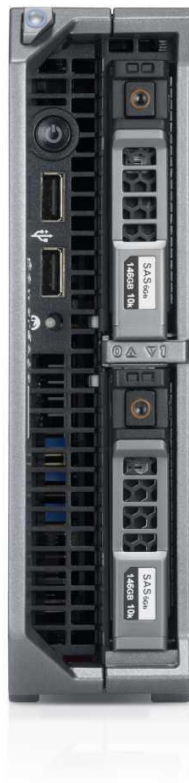
Figure 1. M520 front view

The chassis design of the M520 is optimized for easy access to components and for airflow for effective and efficient cooling. Figure 2 shows the M1000e chassis enclosure populated with M520 modules.