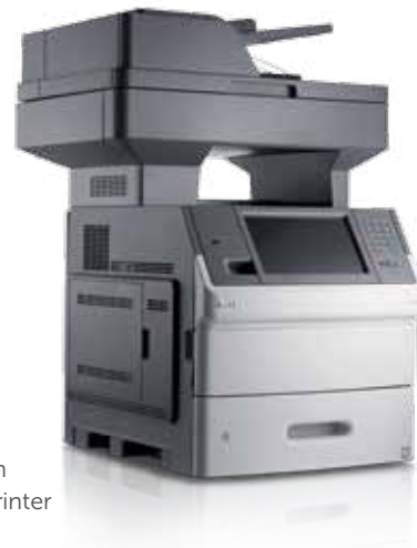
The Dell 5535dn Multifunction Printer

The Dell Legal Print Station is available as an option with the Dell 3333dn, 3335dn, and 5535dn Multifunction Printers