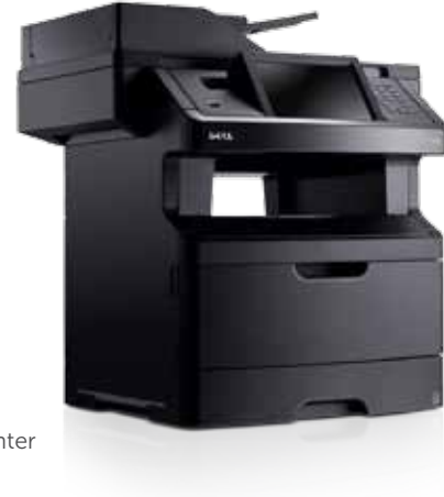
The Dell 3333dn Multifunction Printer

The Dell Healthcare Print Station is available as an option with the Dell 3333dn, 3335dn, and 5535dn Multifunction Printers