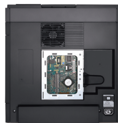
Dell 2150cn/cdn rear view