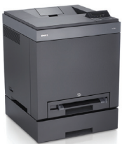
Dell 2150cn/cdn color laser networked printers with optional 250-sheet drawer