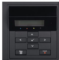
Dell 2150cn/cdn control panel